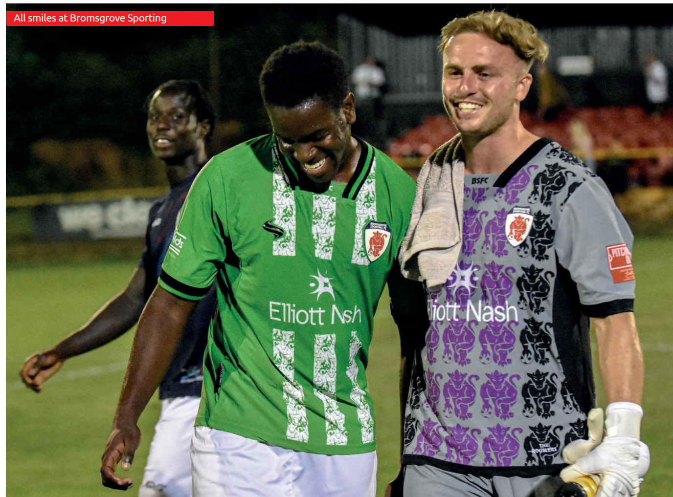
All smiles at Bromsgrove Sporting

"It's gone now and we have to ensure that we respond in the right way at Alvechurch on Saturday, that's all we can do. We've not made any excuses; circumstances didn't help our situation, but we have to be better than that."