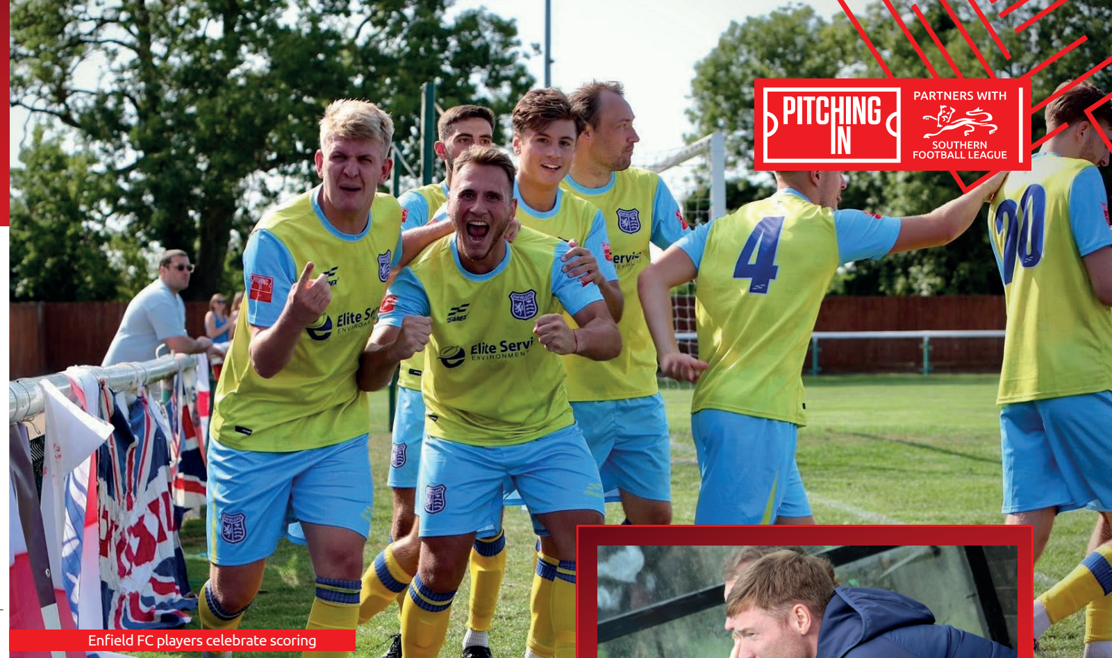
Enfield FC players celebrate scoring

"My focus will be on improving game to game and if both I and the team can be better than last season, then that will be progress and that's all you can ask for."